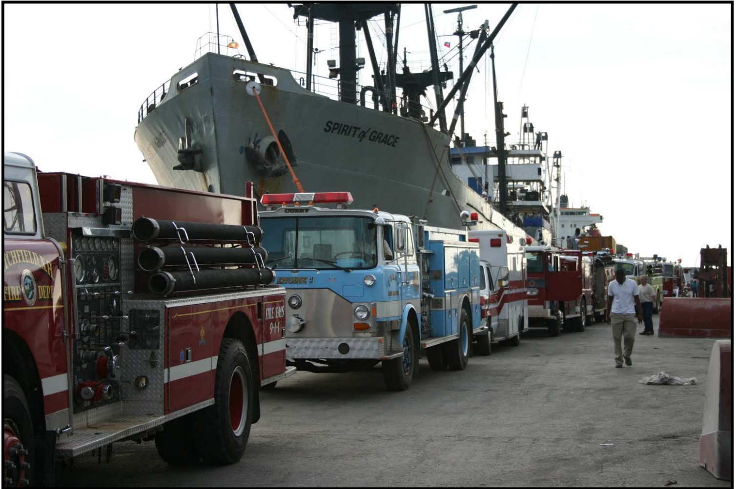
Spirit of Grace in Haiti delivering fire trucks and ambulances

FRIEND SHIPS at PORT MERCY, 1019 North First Avenue, Lake Charles, LA 70601 Tel: 337-433-5022 Fax: 337-433-3433 Email: info@friendships.org Website: www.friendships.org