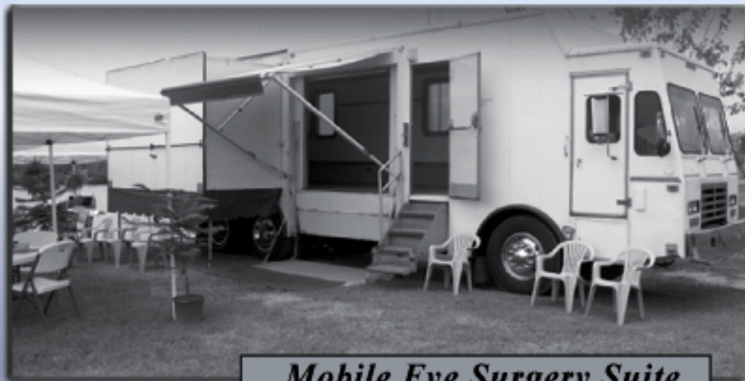
Mobile Eye Surgery Suite

With missions to Honduras and Haiti planned, initiation of the soccer outreach in Roatán and standing by for disaster relief here in the US or overseas, 2010 promises to be exciting. We hope to complete work on the mobile eye clinic that is awaiting donations of the needed eye surgery equipment. Also we want to work on the mobile CAT scan trailer and new mobile kitchen as well as warehousing and housing construction projects at home base Port Mercy!