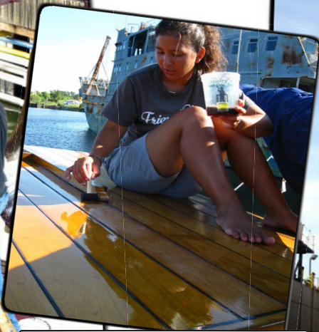
Divine Wind - varnishing