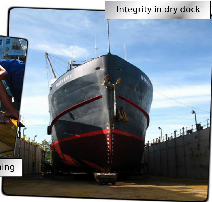
Integrity in dry dock