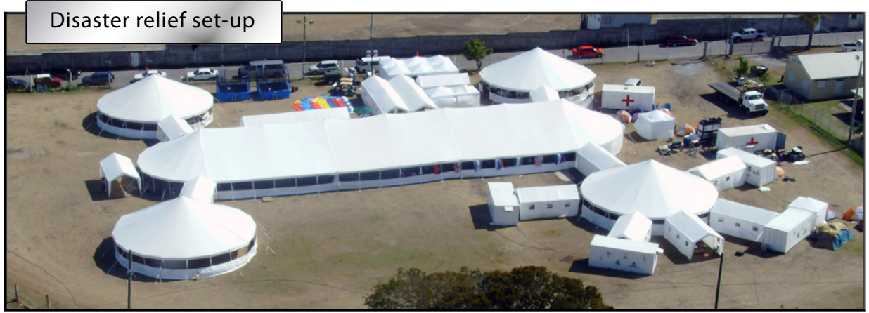
Disaster relief set-up

set up a few years ago on a medical mission to the West Indies. This set-up is also available for use on disaster outreaches, either overseas or here in the U.S. when the situation calls for a large, long-term response. Every service we perform is accompanied with prayer and spiritual encouragement.