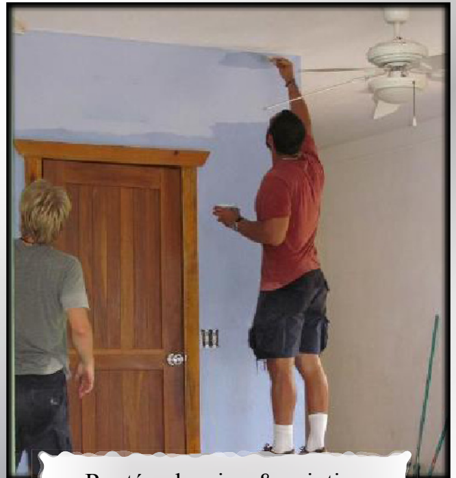
Roatán cleaning & painting

testing, helped clean and paint the food pantry for the new French Harbor food ministry, served breakfast and lunch and ministered to the women and children who came.