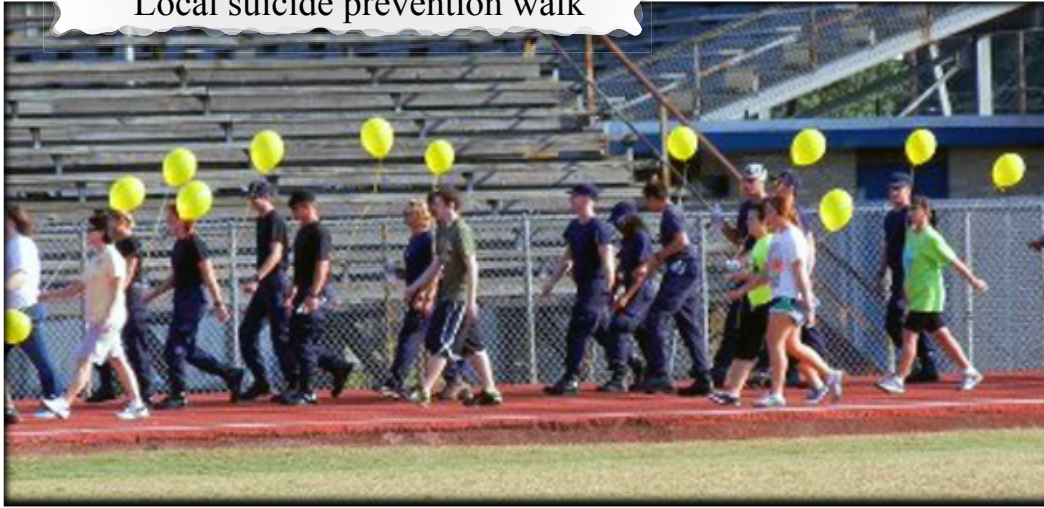
Local suicide prevention walk

FRIEND SHIPS at PORT MERCY, 1019 North First Avenue, Lake Charles, LA 70601 Tel: 337-433-5022 Fax: 337-433-3433 Email: info@friendships.org Website: www.friendships.org