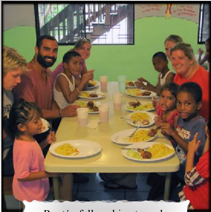
Roatán fellowship at meals