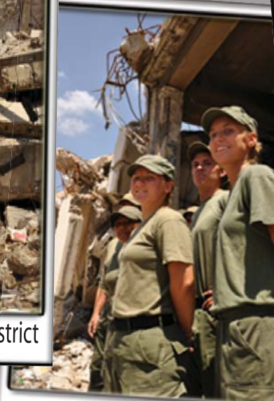
The Lady Hawks ready to serve