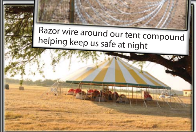
Big top tent in our field