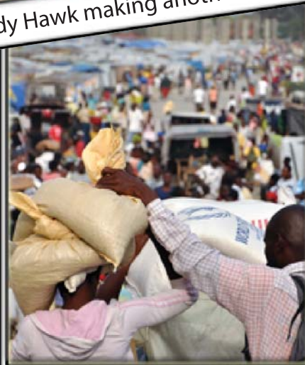
Tent city traffic