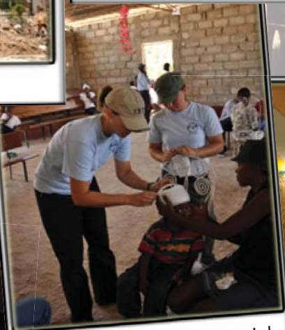
Stitching & fixing - a constant job