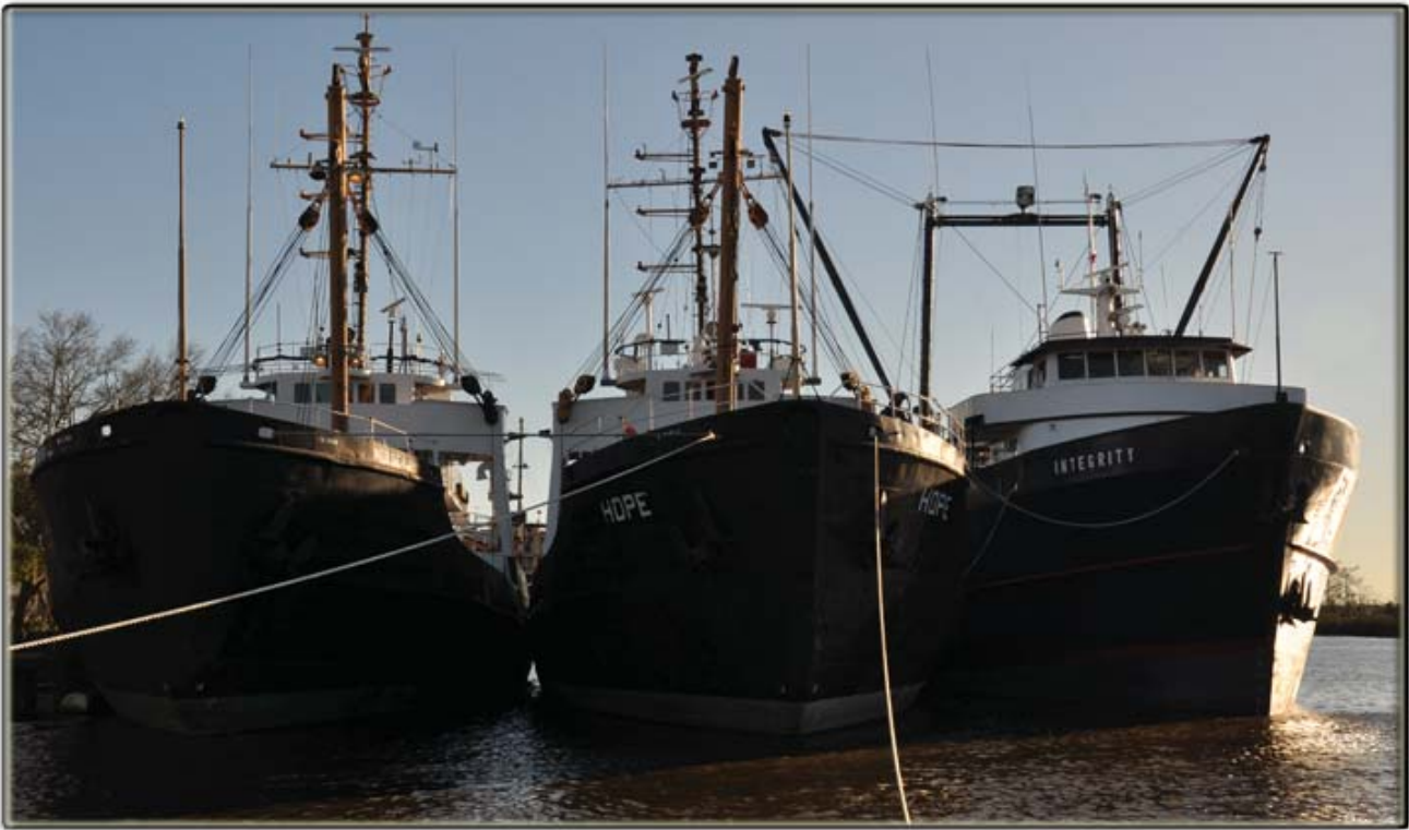
Three of the Friend Ships fleet

FRIEND SHIPS at PORT MERCY, 1019 North First Avenue, Lake Charles, LA 70601 Tel: 337-433-5022 Fax: 337-433-3433 Email: info@friendships.org Website: www.friendships.org