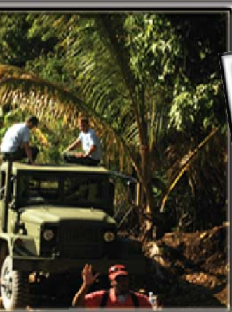
my truck works the