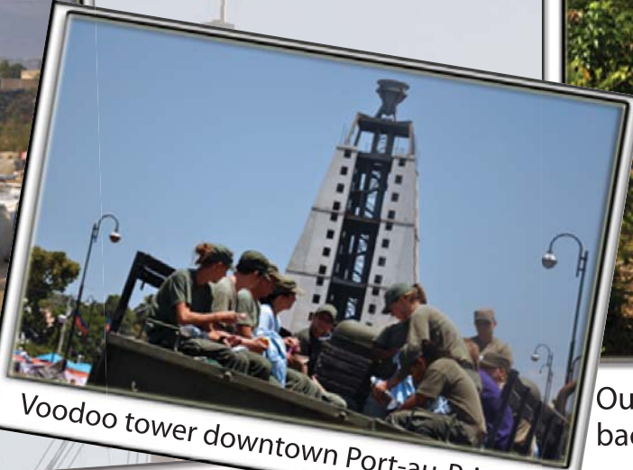
Voodoo tower downtown Port-au-Prince