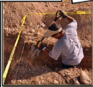
Sea Hawks digging trenches