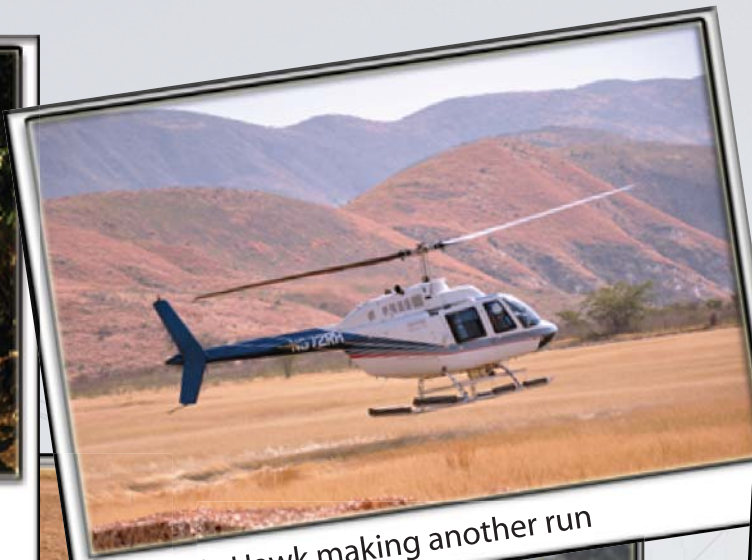
Lady Hawk making another run