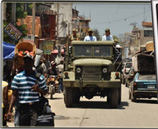
Truck headed home after a long day