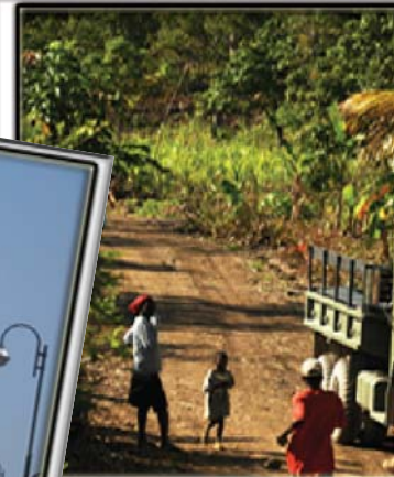
Our deuce & a half in the back country