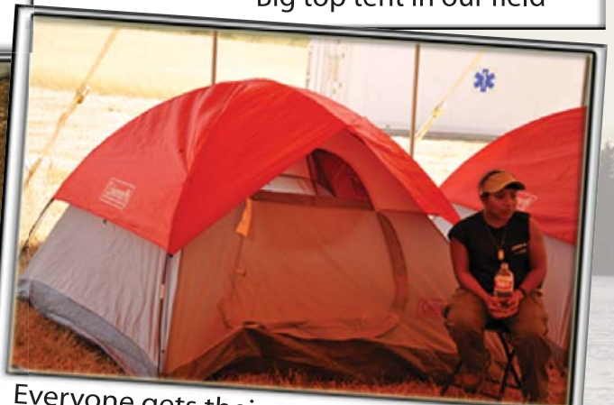
Everyone gets their own private pup tent