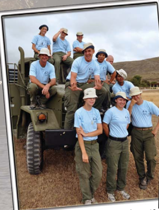
Outside the tent, the Sea Hawks pose for a picture