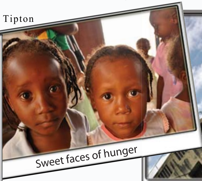
Sweet faces of hunger