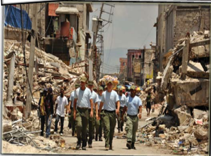
Sea Hawks working the streets in the downtown district