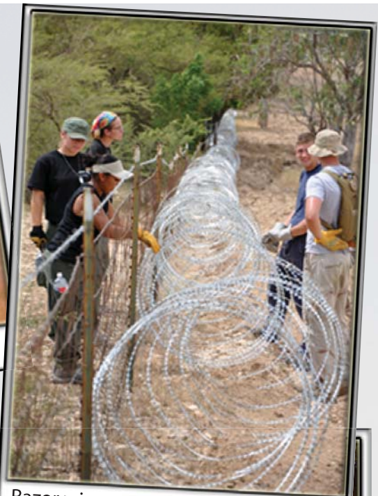
Razor wire around our tent compound helping keep us safe at night