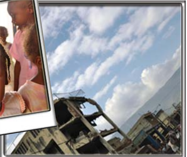
70% of the countries capitol city is totally destroyed