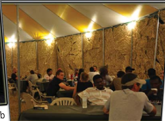
Nighttime, a dining experience