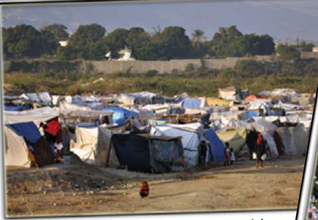
One of thousands of small tent cities