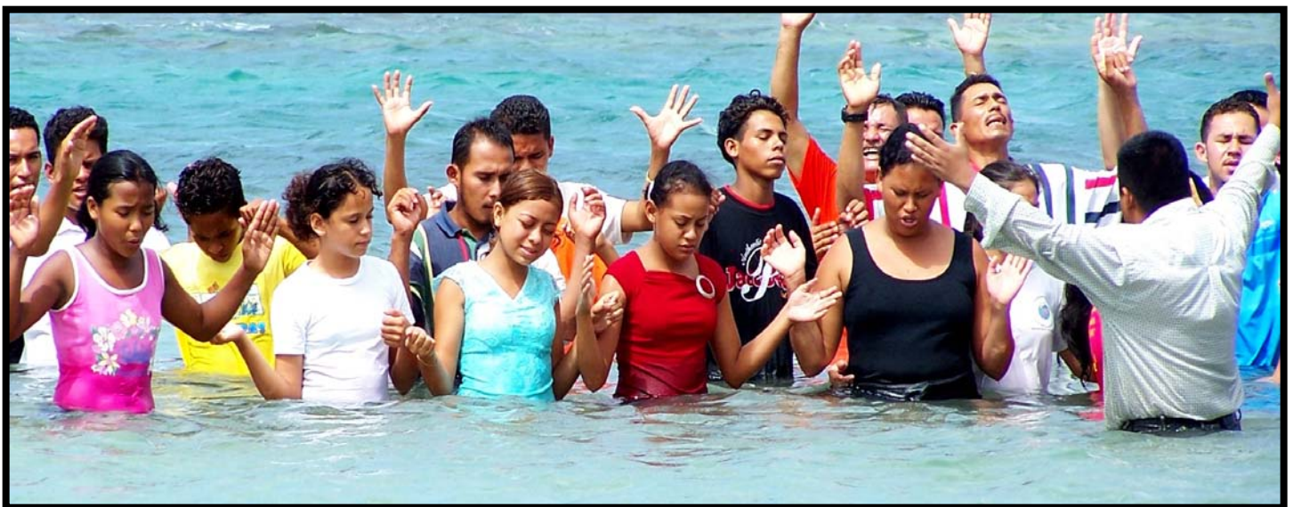
Roatán youth being baptized in the Caribbean Sea (below)

The team at The Village continues to prepare to expand our capacity to be able to house 500 people for each seminar, and also planning for the upcoming mission in November. Thank you Lord for changing lives!