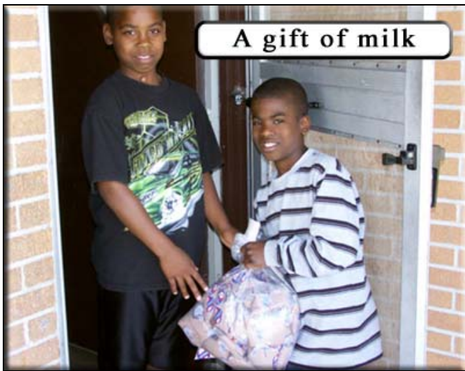
A gift of milk