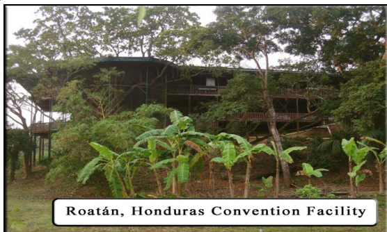
Roatán, Honduras Convention Facility

The Village continues to host church conferences with 100-200 people attending each weekend. We distributed mattresses, delivered by a cruise liner, to those on the island that are in need. When a local church was destroyed by vandals, we were able to provide tarp material to reconstruct the facility and on its first day to re-open, 2000 members attended!