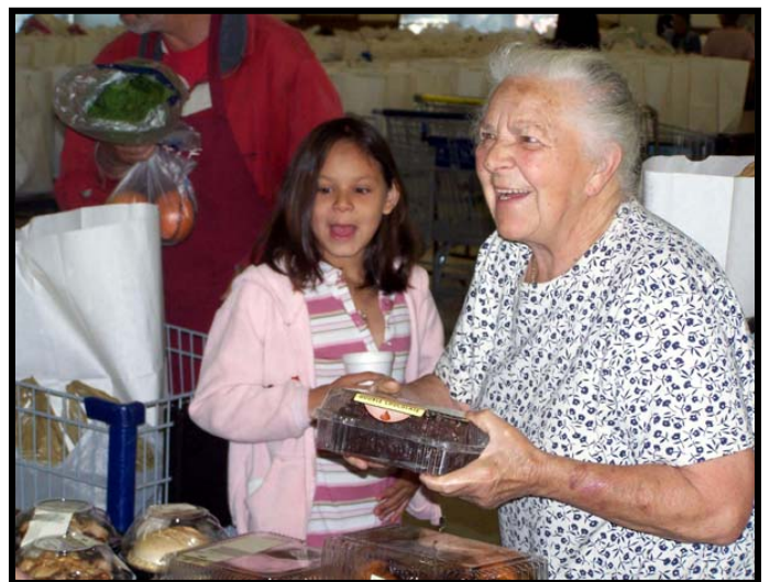
Families receiving food

Based in Los Angeles, Storehouse One is a food program that has collected and distributed 56 million pounds of food to people living in the U.S. through local churches. Storehouse One continues to distribute food every week. A smaller version of this program operates from Port Mercy, providing food to local Christian ministries.