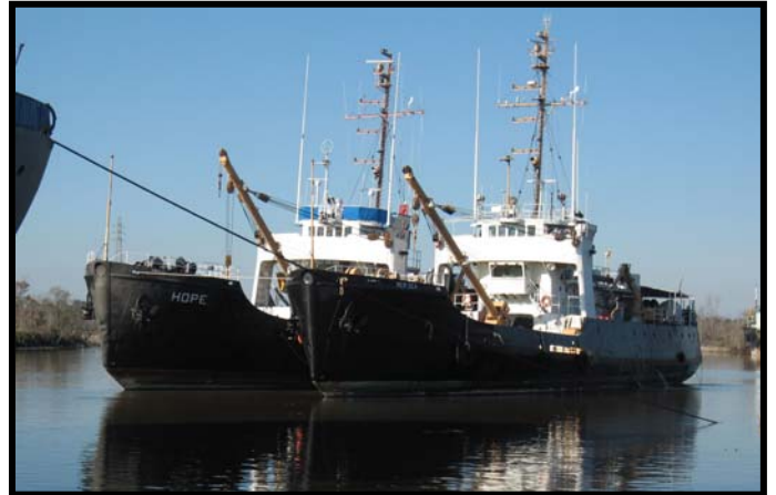
Disaster Relief Ships Hope and Mersea